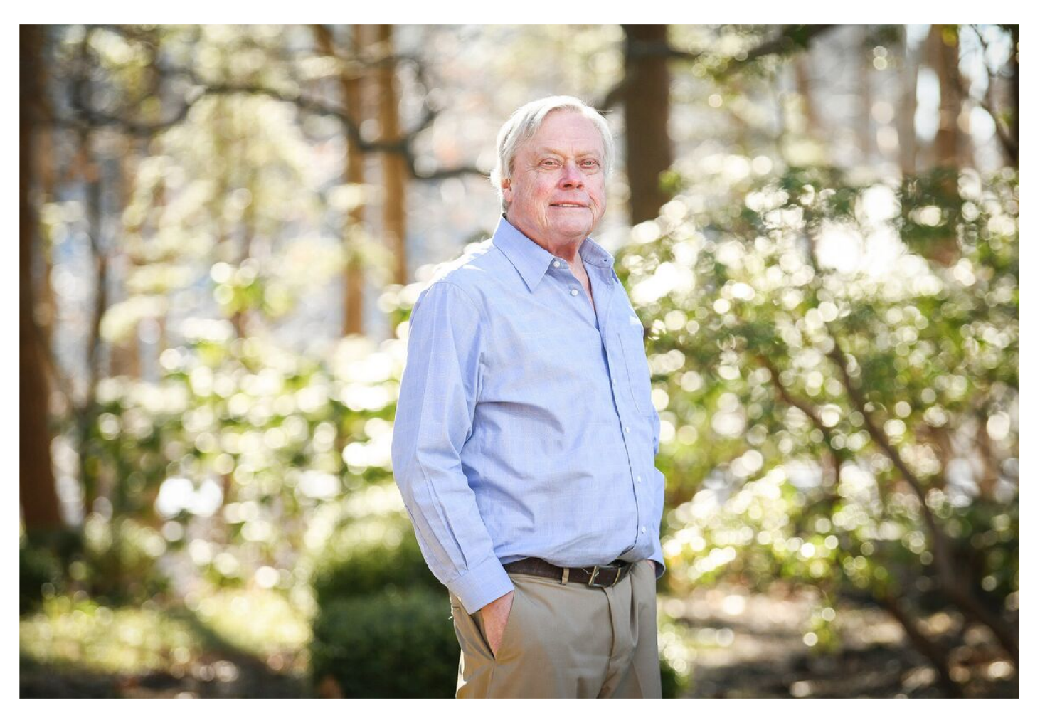
"Natural gas really is not a bridge fuel or really isn't any better for the climate than coal," Howarth said in an interview.

The argument that LNG, which generates about half the carbon dioxide of coal when combusted, is relatively less damaging to the climate hinges on an important caveat. To have a lower warming impact than coal, only a minuscule amount of methane – the primary component of fossil gas – can leak as it moves through vast global supply chains that often begin at wellheads in the scrublands of Texas and Oklahoma and span thousands of miles across oceans, to furnaces and power stations in cities from Shanghai to Hamburg.